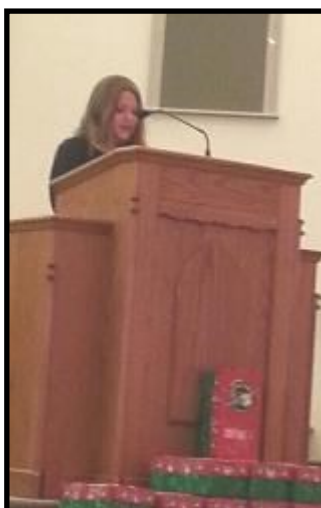
Elora, OCC Shoebox Dedication